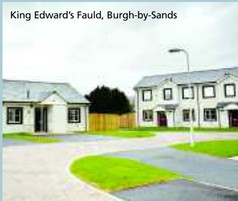
King Edward's Fauld, Burgh-by-Sands

We have extensive knowledge of developing in National Parks and Conservation Areas and we know about the special demands these areas bring with them.