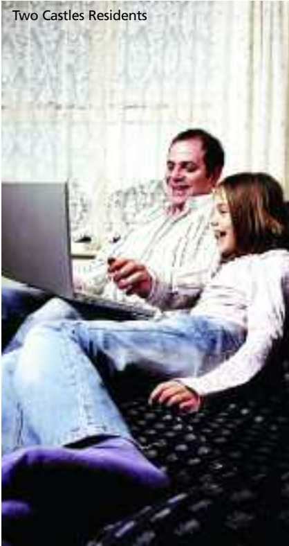
Two Castles Residents