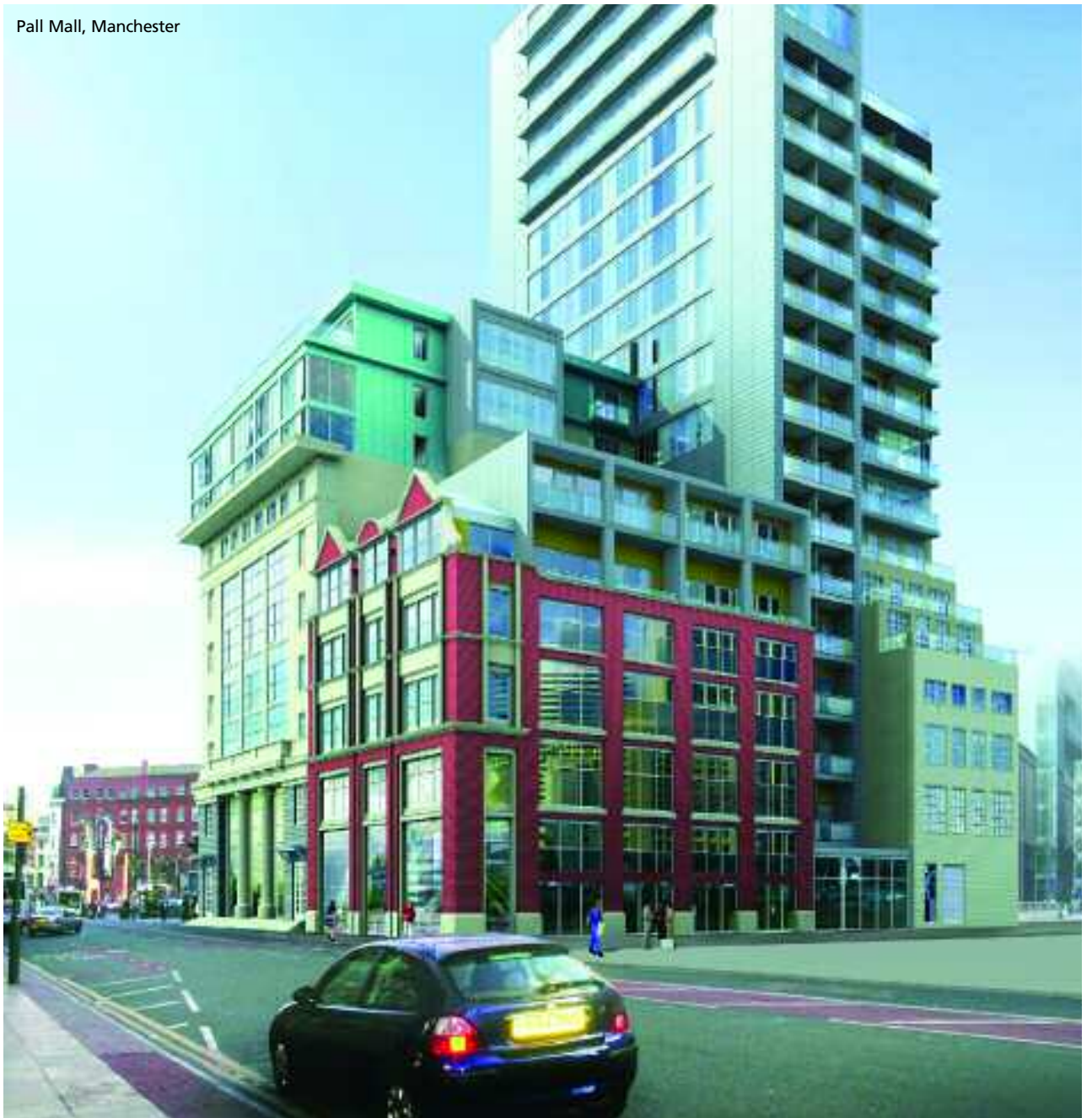
Pall Mall, Manchester