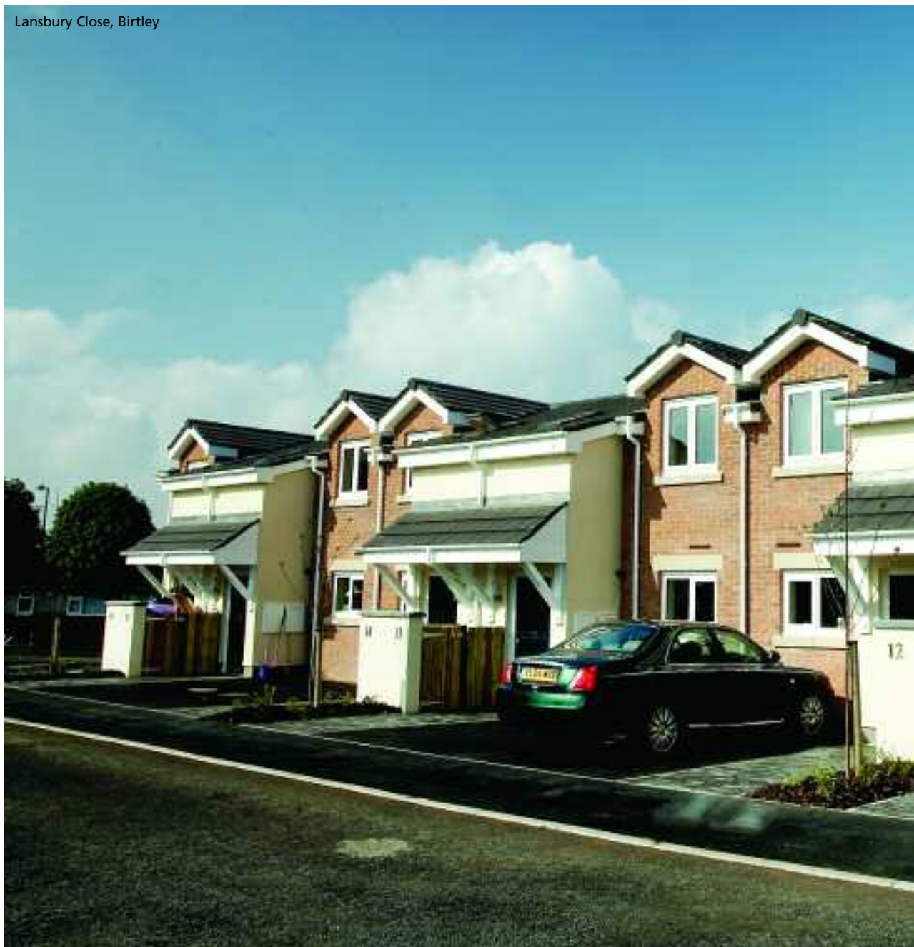
Lansbury Close, Birtley

We have extensive knowledge of developing in National Parks and Conservation Areas and we know about the special demands these areas bring with them.