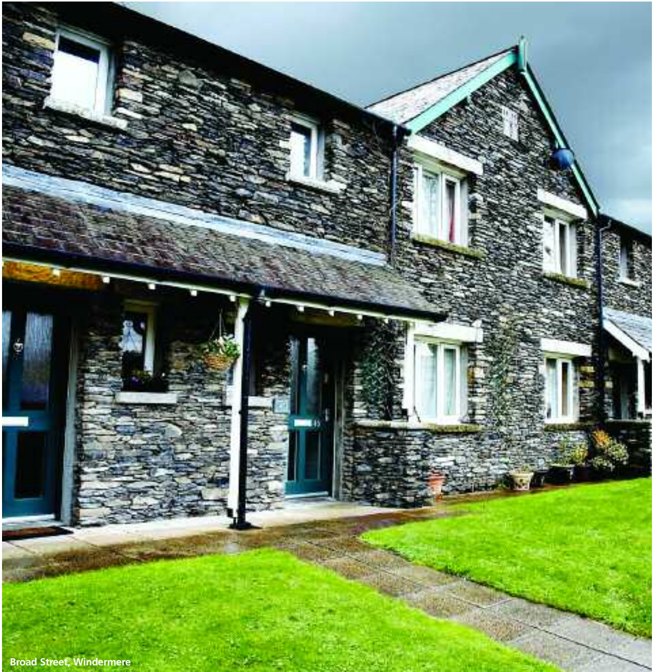
Broad Street, Windermere