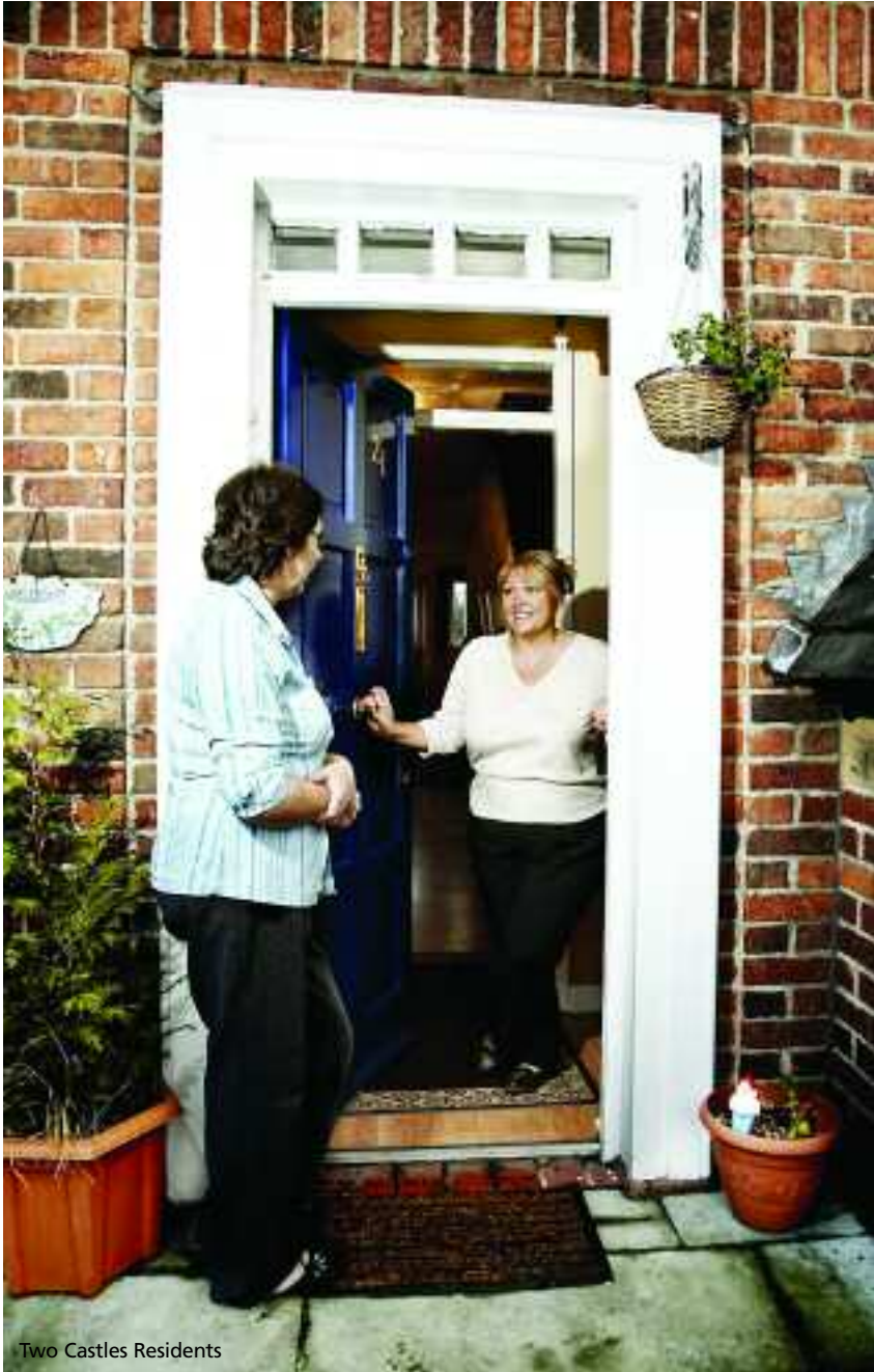
Two Castles Residents

There is a genuine sense of community spirit in our developments